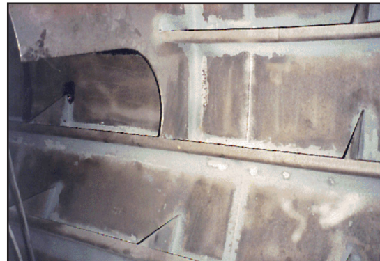
Weld seam grit blasted awaiting coating